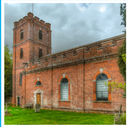
St Mary's Church Avington