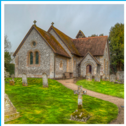
St John's Church Itchen Abbas