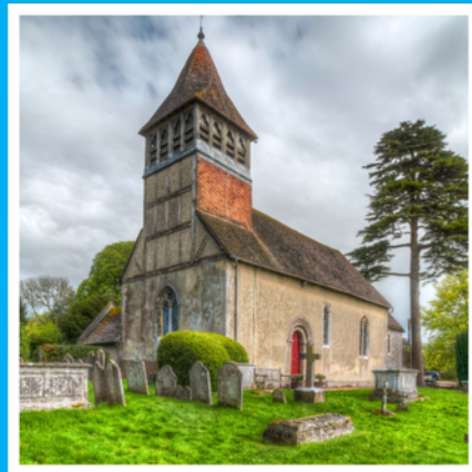
St Swithun's Church Martyr Worthy