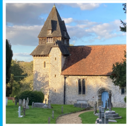
St Mary's Church Easton