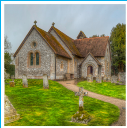
St John's Church Itchen Abbas