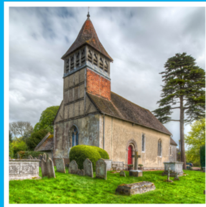
St Swithun's Church Martyr Worthy