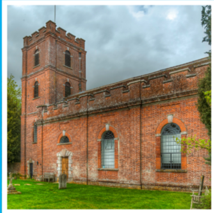
St Mary's Church Avington